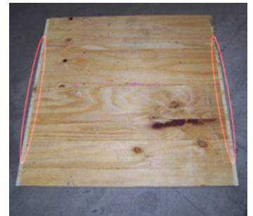
(2) Side Panels rabbeted on 2 edges