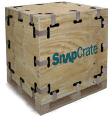
Assembly is a snap!

CAUTION: To avoid possible injury, place your hand over the V-Snap Fastener as you release it with the Fastener Release Tool . Once secured and snapped into place, the fasteners will not come off until you want to take them off. Gloves and safety glasses are recommended when assembling and/or dismantling SnapCrates.