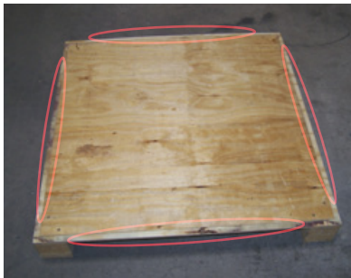
(1) Base featuring rabbeted edges on all 4 sides