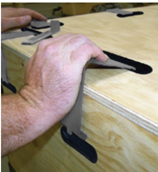
SNAPPING FASTENER INTO PRE-CUT SLOTS