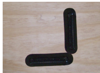
Close-up of pre-cut fastener slots