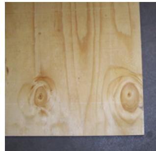
(2) Front/Back Panels no rabbeted edges