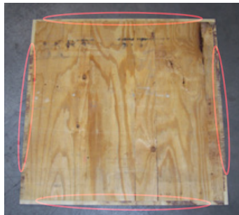
(1) Lid featuring rabbeted edges on all 4 sides